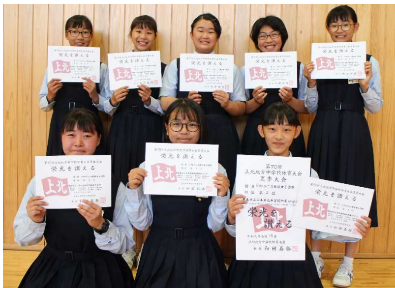
The Girls' Soft Tennis Club went to the Prefectural Tournament!

THE HANDBALL CLUB WENT TO THE NATIONAL CONVENTION LAST YEAR. THE TRACK AND FIELD CLUB AND THE SOFT TENNIS CLUB WENT TO PREFECTURAL TOURNAMENT THIS YEAR!