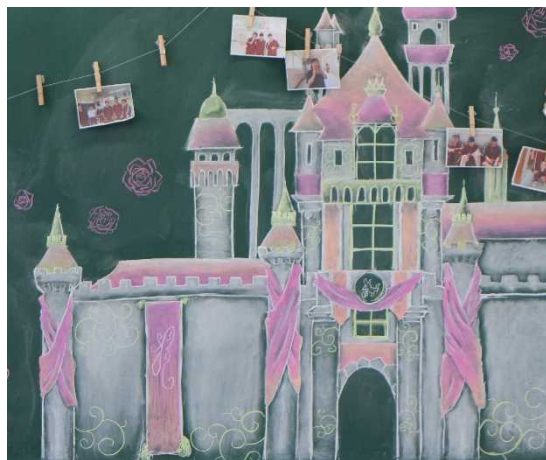
It's a wonderful "unreal" world.

Unreal is an impractical world and people can imagine anything. Imagination is infinite. We ask you again: When you hear unreal, what world do you think about?