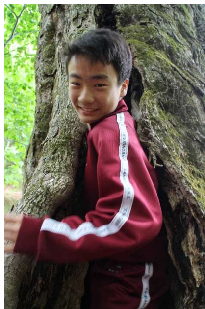
Forest Environment Field Trip

If you come to our chorus contest, you can be impressed.