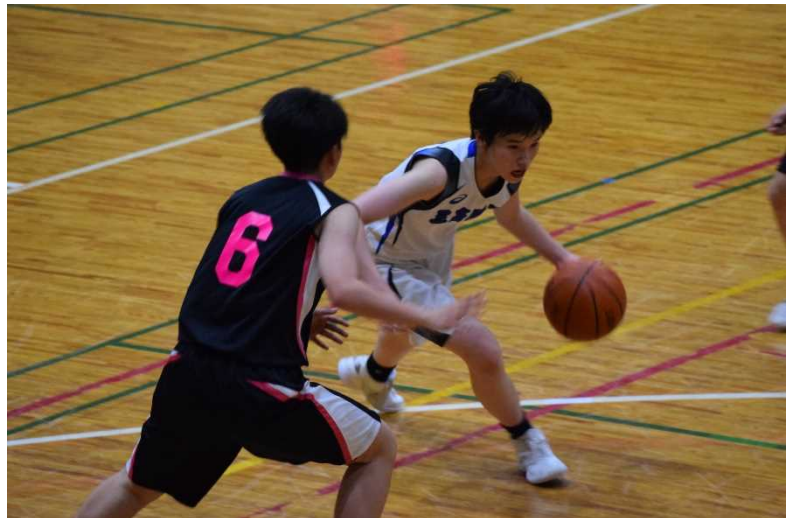
Girls' Basketball Club