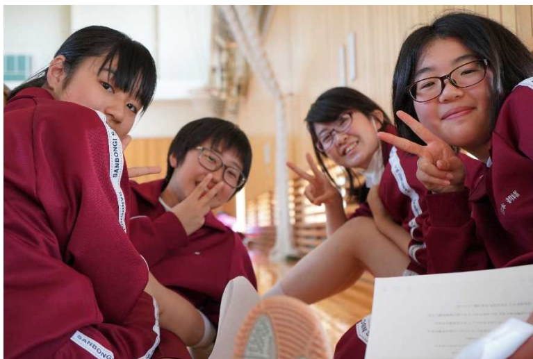
School Festival Preparations

If you are interested in Fuzoku, come and enjoy English Camp with everyone!