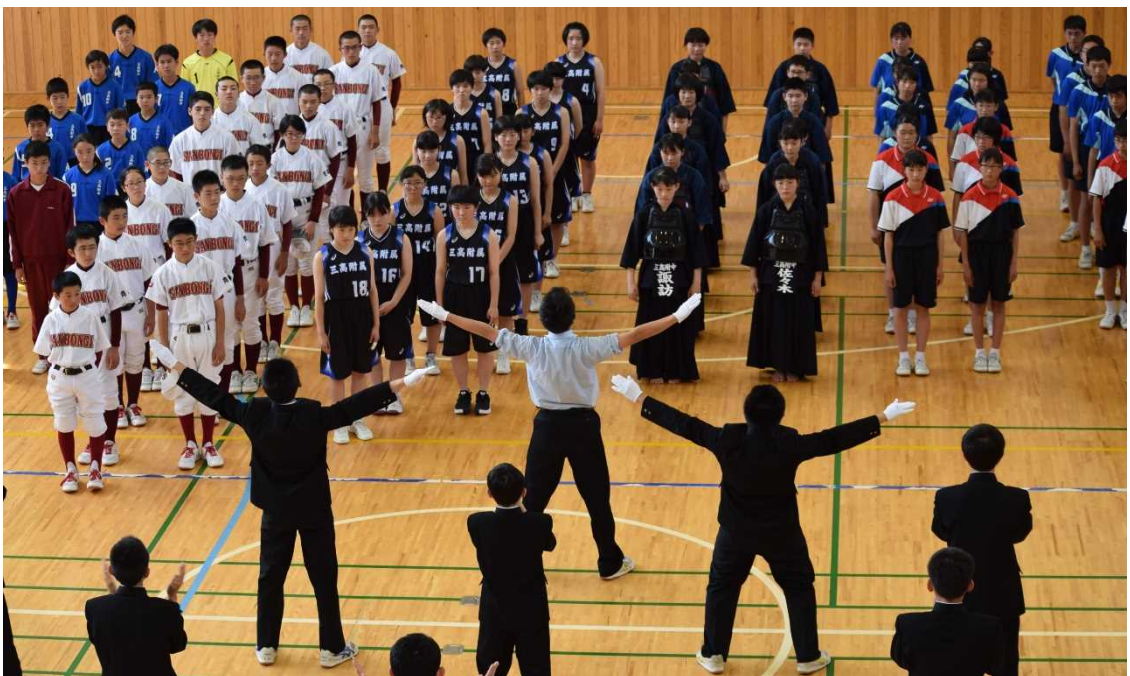
They are cheering on the sports clubs.